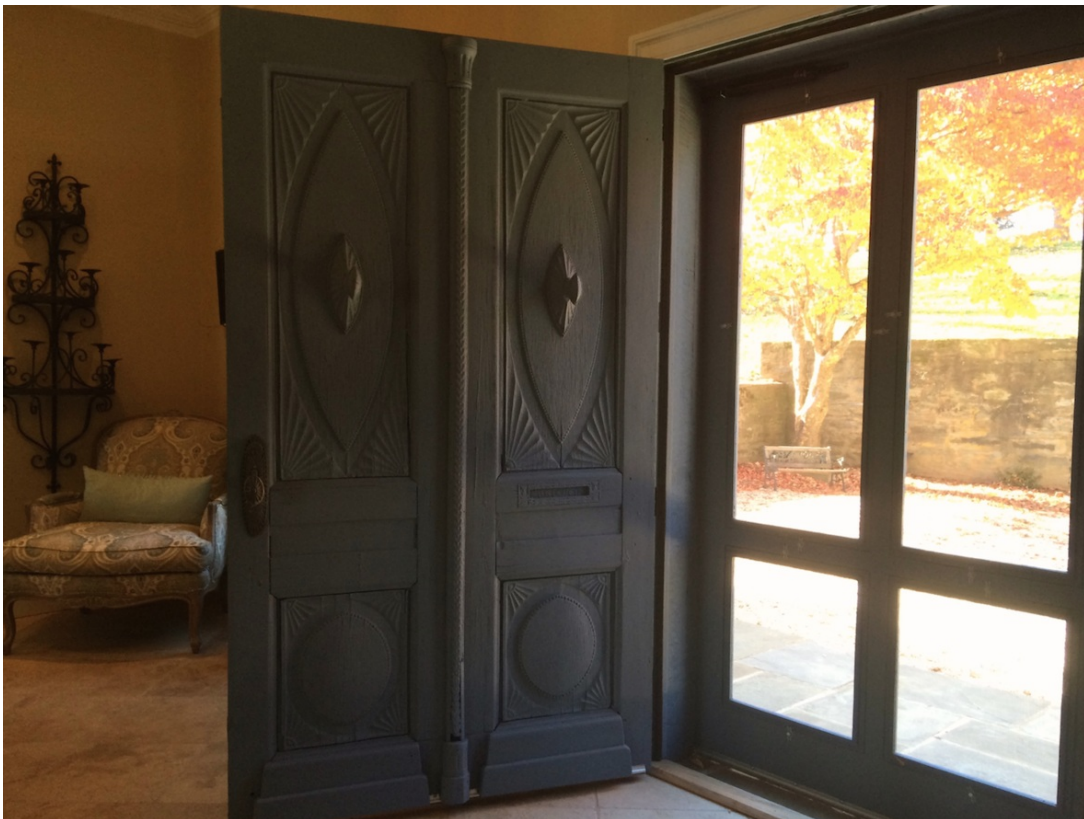
Front door, courtyard view.

The gentle sound of a fountain now welcomes, orients and guides visitors to the front door.