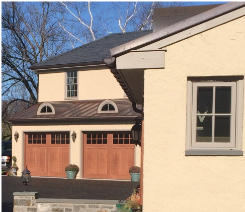
New garage with eyebrow windows. View from courtyard.

Throughout the house, the movement of natural ventilating air was as much considered as the movement of people.