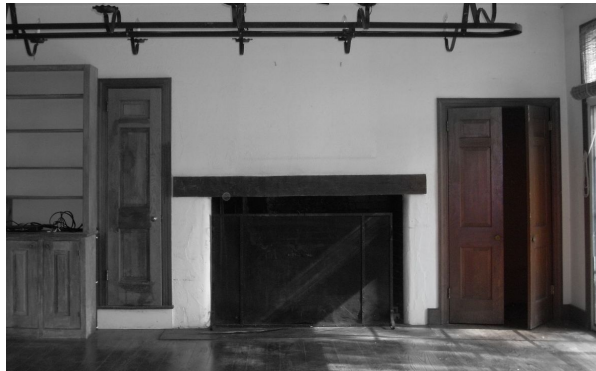
Fireplace in kitchen area (before). Glare from French doors is uninviting.