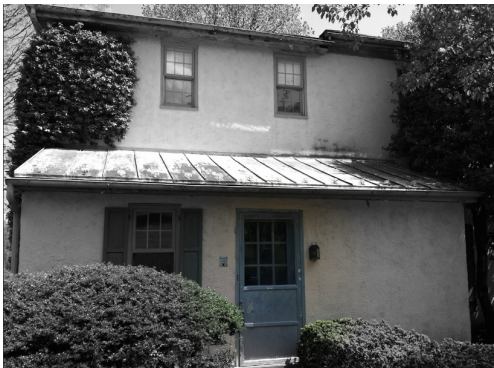
Family entry (before).