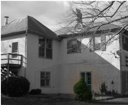
Patio (before).