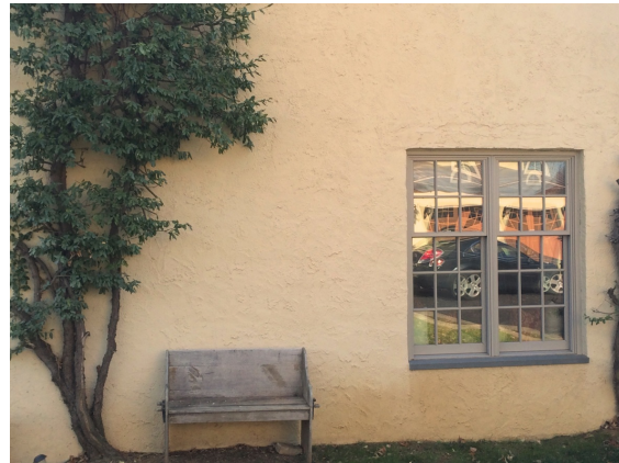
Partial East elevation with new kitchen window.

A new garage was built to mirror the main house and to create an arrival courtyard. Garage eyebrow roof windows match those above the family entrance. Seen together, the 3 + 3 eyebrows create a welcoming, embracing “you’ve arrived in the middle” gesture for arrival.