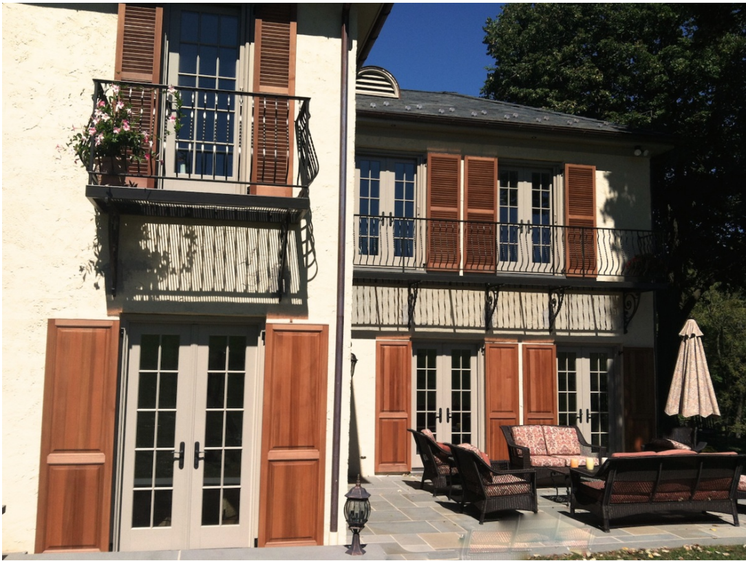
Patio (after) becomes outdoor living space after adding 6 pairs of French doors.