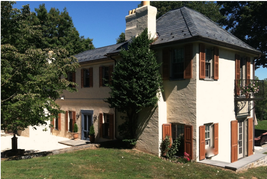
West view (after). Balcony replaces stairway, 4 corner windows and 3 French doors added.