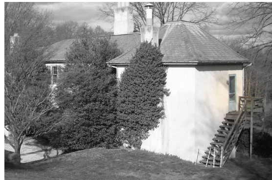
West view (before).