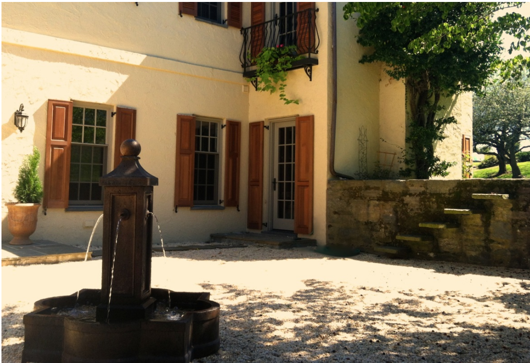
Revived courtyard/outdoor living room with fountain.

The gentle sound of a fountain now welcomes, orients and guides visitors to the front door.