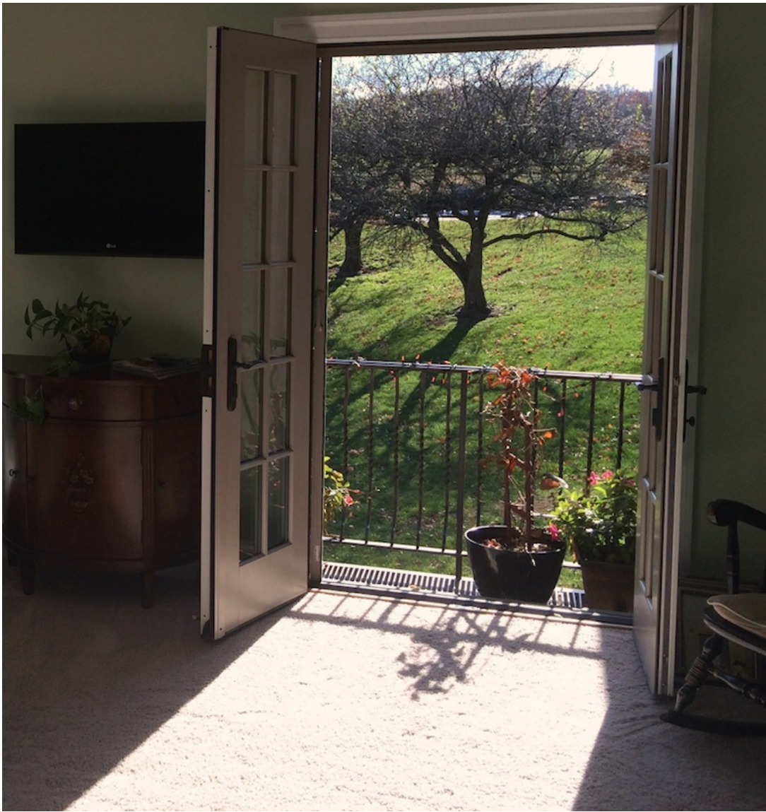
Master bedroom with added French doors and balcony overlook.