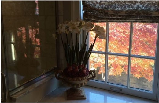
Added corner windows, arches, alcoves, window seats and French doors.