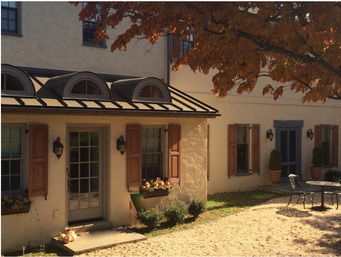
Family entry with courtyard (after); added windows, French doors and eyebrow dormers.