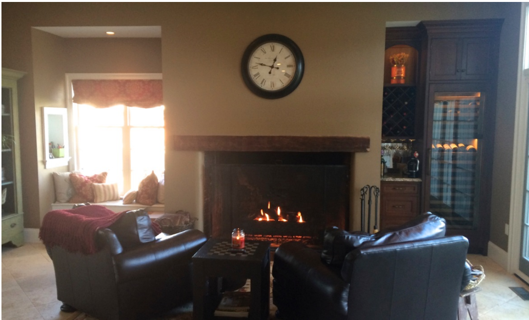
Fireplace in kitchen area (after). Light levels were re-balanced by removing service stair and replacing it with a new double bay window.

Throughout the house, the movement of natural ventilating air was as much considered as the movement of people.